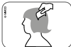
Illustration: Combing the wet hair out from the scalp to the ends with the lice comb